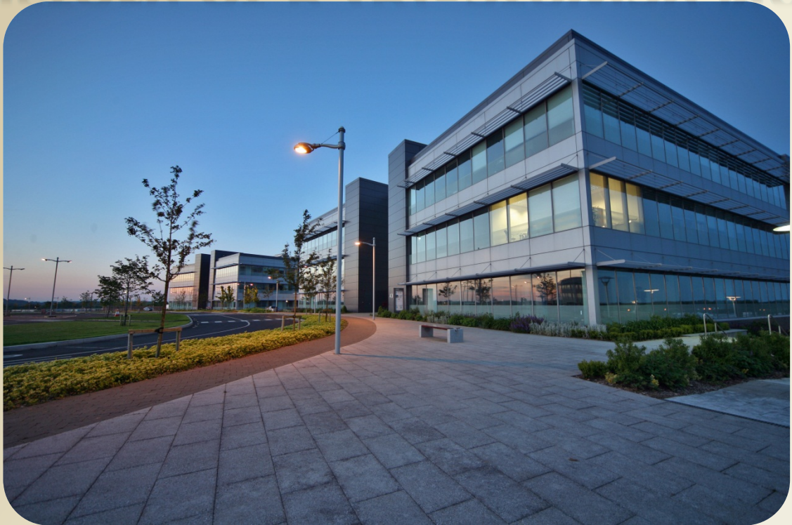
B2BGateway.Net European Headquarters | Shannon, Ireland

S hannon Systems LLC was founded in April 1999, in Boston, Massachusetts, USA as a privately held software development company providing custom developed utilities, programs and data conversion software. One of our products, “The B2BGateway”, was designed to provide organisations with an easy solution to the complexities of EDI. Simply put, data would be sent to our organisation over the internet, where it would be converted and sent to another organisation in a different format. Eventually, people using “The B2BGateway” began to refer to the company as B2BGateway and we now do business as B2BGateway.Net.