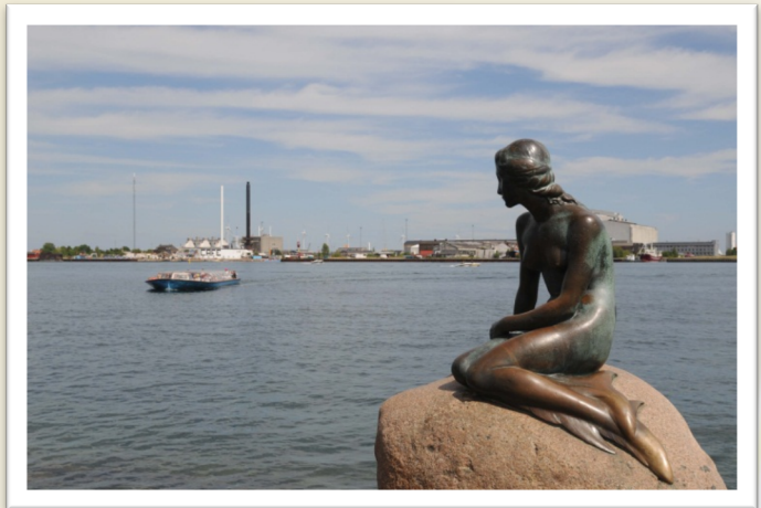
The Little Mermaid | Copenhagen, Denmark

Having THESEN.EU as a partner in the Nordic Region, B2BGateway.Net can deliver cost effective, quality EDI and Data Integration solutions covering all standards (oioUBL, EDIFACT, Tradacoms, X12, Odette, Eancom, XML etc.) and all communication protocols (VAN, AS2, FTP, FTPs etc.) to clients in their native language and time frame. B2BGateway.Net's EDI solutions can fully integrate with all ERP / Accounting software packages including SAP, Microsoft Dynamics (AX, GP, Nav), Oracle, Lawson, Mamut, Sage, NetSuite etc. For further information on our solutions and services in the Nordic Region please call +45 22 23 99 88 or email Scandinavia@B2BGateway.EU